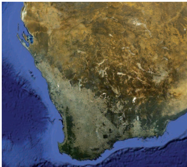
Figure 2. Satellite imagery of south-western Australia, showing the extent of native vegetation clearing due to agriculture.

More recently Lyon's group was able to show that not only did this land cover change modify regional rainfall patterns, but with it may have come very significant changes in atmospheric